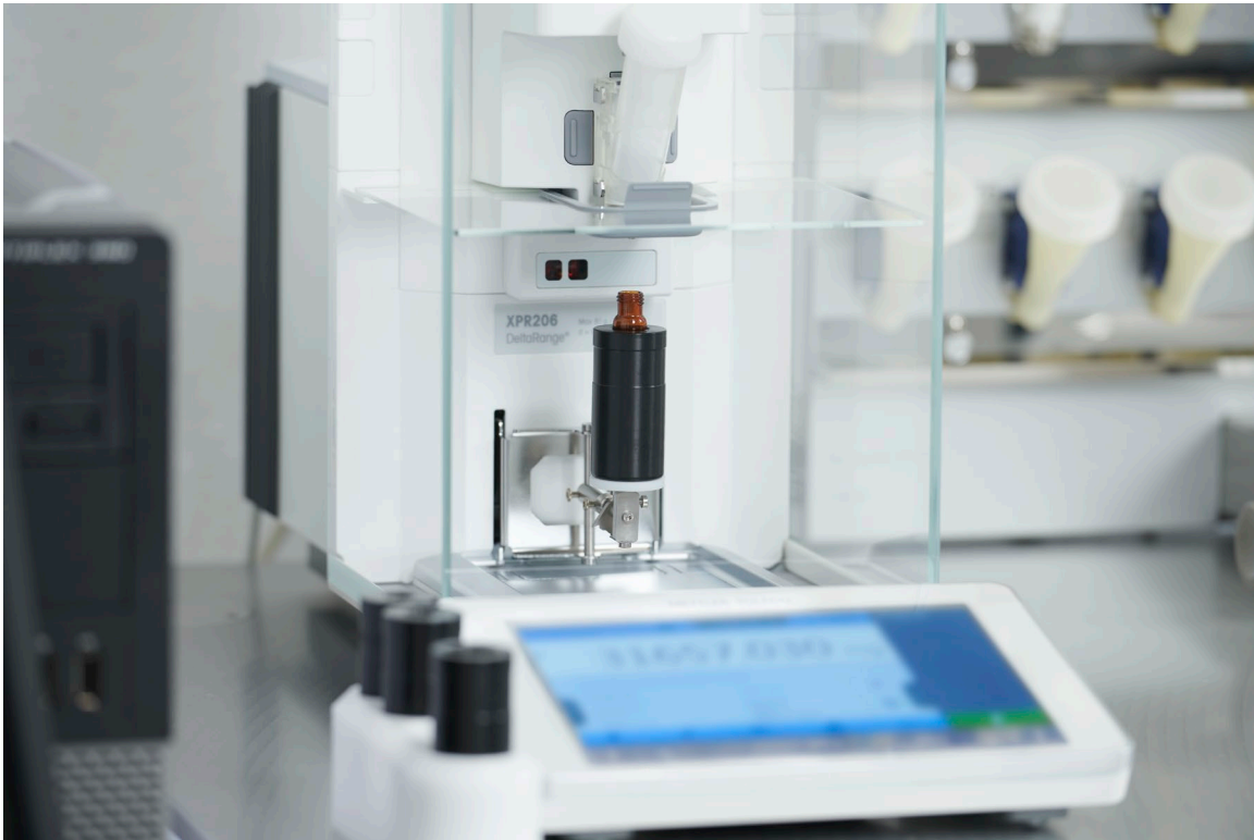
Figure 1: Precise and traceable solid dispensing with XPR from Mettler-Toledo.