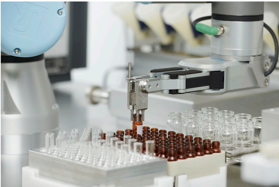
Figure 2: Various vessel sizes usable.